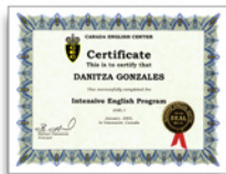
Certificate of Completion

The Certificate of Achievement is the official detailed progress report issued by CEC to students who pass their courses.